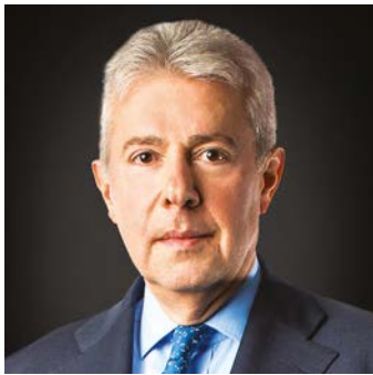
Chairman of the Board, President and Chief Executive Officer